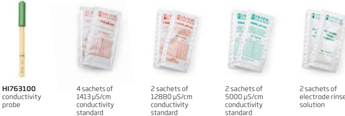
HI763100 conductivity probe 4 sachets of 1413 µS/cm conductivity standard 2 sachets of 12880 µS/cm conductivity standard 2 sachets of 5000 µS/cm conductivity standard 2 sachets of electrode rinse solution

edge®EC: HI2003-01 (115V) and HI2003-02 (230V) also includes: