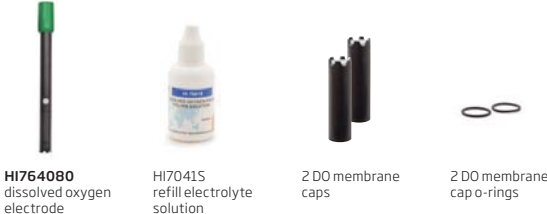
HI764080 dissolved oxygen electrode HI70415 refill electrolyte solution 2 DO membrane caps 2 DO membrane cap o-rings

edge®DO: HI2004-01 (115V) and HI2004-02 (230V) also includes: