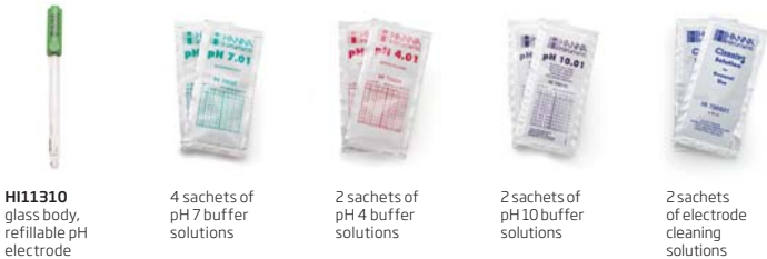
HI11310 glass body, refillable pH electrode 4 sachets of pH 7 buffer solutions 2 sachets of pH 4 buffer solutions 2 sachets of pH 10 buffer solutions 2 sachets of electrode cleaning solutions

edge®pH: HI2002-01 (115V) and HI2002-02 (230V) also includes: