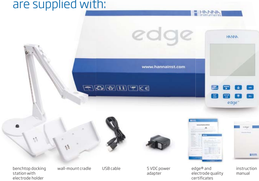
benchtop docking station with electrode holder wall-mount cradle USB cable 5VDC power adapter edge® and electrode quality certificates instruction manual

All edge® single parameter meters are supplied with: